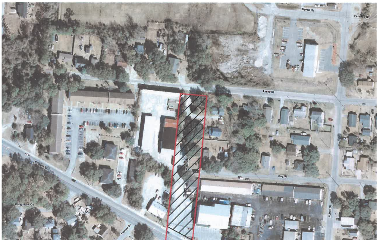
North Carolina Railroad Company Wye Parcel Extension Town of Morehead City, Carteret County

Encroachments: Licensee claims ownership and three adjoining landowners have deeds that overlap with NCRR property line.